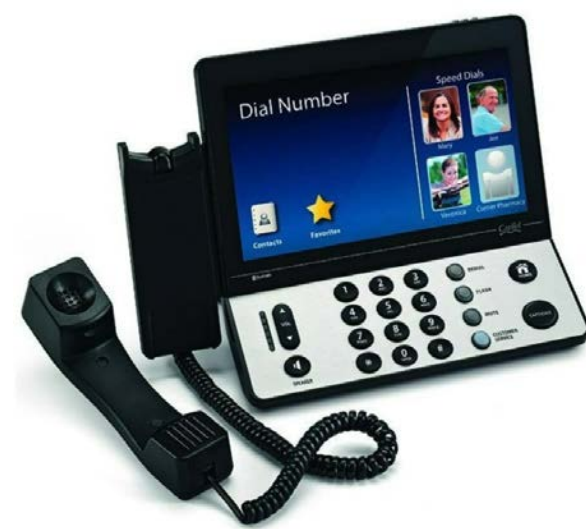
Dial a person's number just by touching their photo.

TIP: If someone helped set up your CapTel 2400i phone, you may want to consult with them as you manage Contact Lists on a computer.